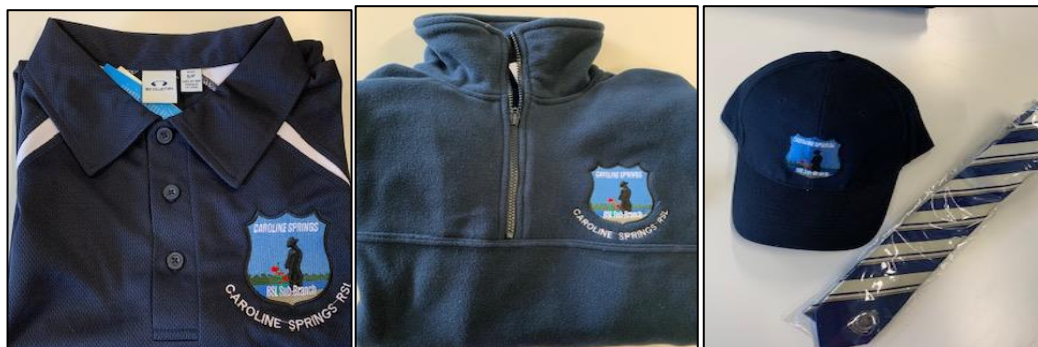
Polo Shirt: $35 Members Non-Members $40 Golf Polo is also available