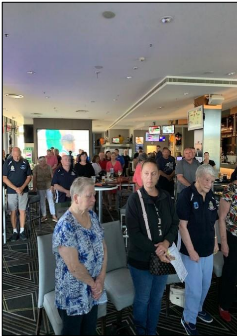
Above: The Ode