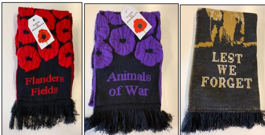
Knitted Scarves: Members $35 Non-Members $45