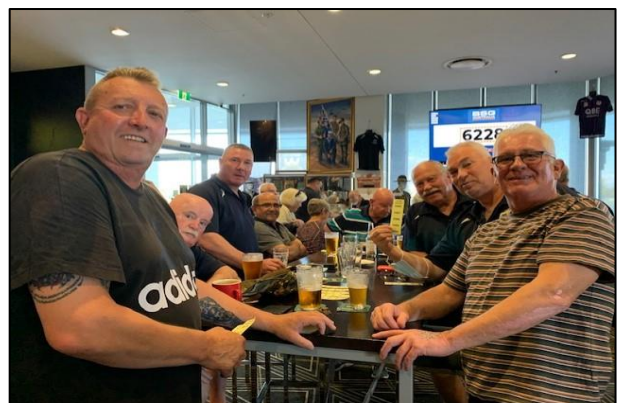
Above: Non-winners are still grinners.